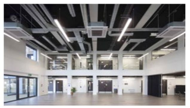
Fig.7 Interns, TEDI London

large-scale equipment, prototyping and 3D printing. There are also viewing galleries, a roof-top terrace, smaller conference-style meeting and teaching rooms, a student common room, and offices.