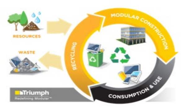
Fig.9 Circular economy of Modular construction

Additionally, the shorter construction time and improved energy efficiency of modular buildings contribute to reduced operational carbon emissions over the building's life cycle. These environmental benefits align with the UK's commitment to achieving net-zero carbon emissions by 2050.